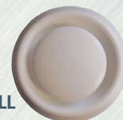
EXHAUST & SUPPLY GRILL